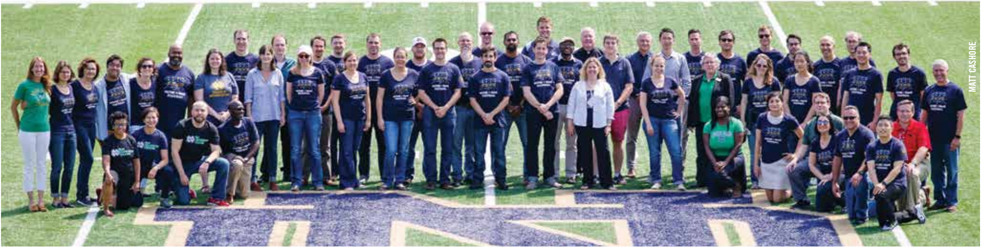
New faculty pay a visit to Notre Dame Stadium during orientation.